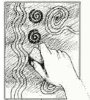
Combine line & stamp

Note: When stamping, use a watercolor wash as the base color. A thinner layer of Fiber Etch® is deposited with a stamp, which can permeate watercolors more easily than inks or acrylics.